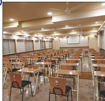
Audio -Visual Room