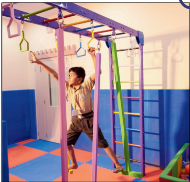
Occupational Therapy Room

1.Classrooms: The campus comprises of series of naturally lit, airy classrooms. Indoor and outdoor spaces intersect and flow into each other so that children can learn, draw and paint. Children are engaged with the campus in many ways, their artworks and poems light up the corridors, lobbies and walls and their imaginations that enhances the entire school environment.