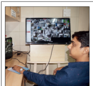
Surveillance Camera Room

e. Transportation: School owns buses and have hired dependable contractors who provides transport facilities to pick children from near their homes and drop them at same point at the end of the school day. The school provides transport to students on request. The codes and policies of transport facilities is given at the time of admission. We also have trained lady attendants to take care of the students on board.