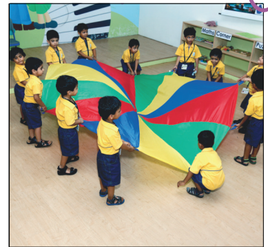
Pre-Primary Activity Room

All our classrooms are equipped with smart TVs, computers with broadband internet access connected to central server with thousands of modules on different subjects. The different modules will help making learning engaging and effective.